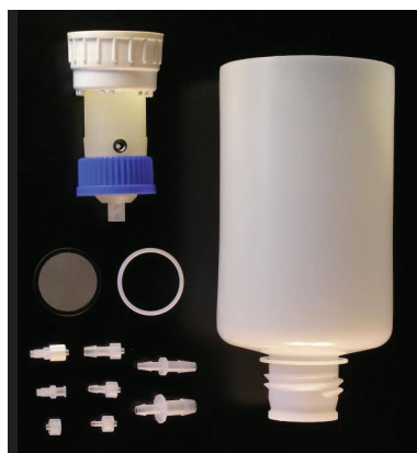
2L Filter Funnel System