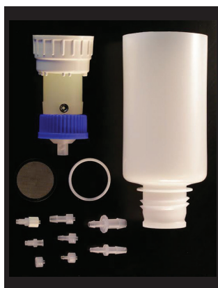
1L Filter Funnel System

Our Vacuum Filter Systems offer several improvements over conventional designs. Engineered for durability and ease of use, this unit features an O-ring seal which makes it easy to seat on a standard GL45 cap closure reagent bottle. The vacuum port has stainless steel 1/4"-28 threads for greater longevity compared to other units and interfaces with standard fittings. A unique retainer ring prevents the filter membrane from twisting and becoming damaged.